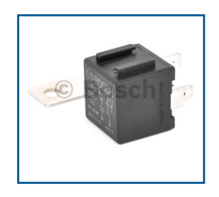
Back to general overview