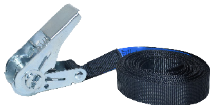
Art. 180 FASTY RATCHET STRAP

1 pce endless, W=25 mm, L=500 cm, 800 kg. Black