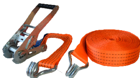
Art. 189 FASTY RATCHET STRAP

1 pce with hooks, W=35 mm, 2-parts (L=50 cm + 450 cm), 2500 kg. Orange