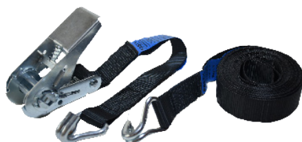
Art. 182 FASTY RATCHET STRAP

1 pce with hooks, W=25 mm, 2-parts (L=30 + 470 cm), 800 kg. Black