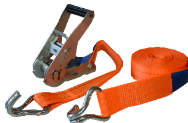
Art. 188 FASTY RATCHET STRAP

1 pce with hooks, W=25 mm, 2-parts (L=30 cm + 470 cm), 1000 kg. Blue