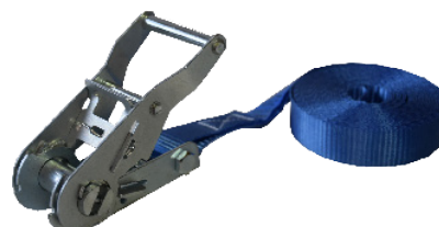
Art. 186 FASTY RATCHET STRAP

1 pce with hooks, W=25 mm, 2-parts (L=30 + 470 cm), 800 kg. Black