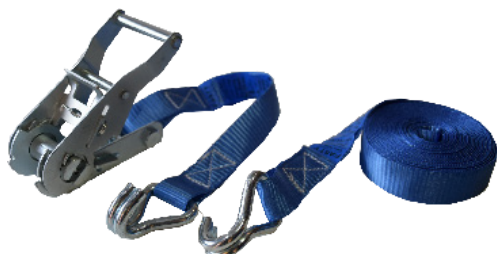
Art. 187 FASTY RATCHET STRAP

1 pce endless, W=25 mm, L=500 cm, 100 kg. Blue