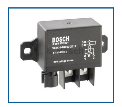
Back to general overview